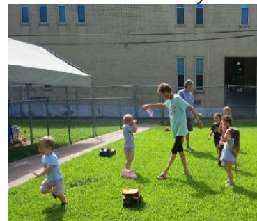
Bubbles, bubbles, bubbles!