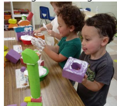
Finger Paint Fun